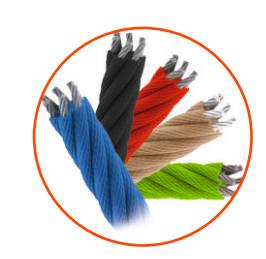
Polypropylene ropes pp multisplit type with a steel core and a diameterof 16 mm