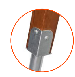
Wooden posts anchored to the ground with powder galvanized and powder coated steel anchors