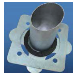
Adjustable Center Anchor