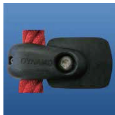
Seat & shield Connector