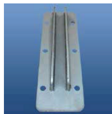
Corner Anchor Plate