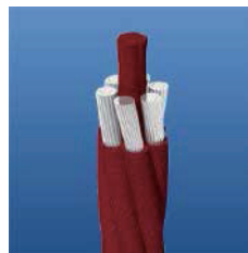
Climbing Net - 20mm