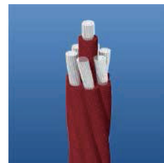
climbing Net - 22mm