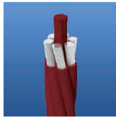
Climbing Net - 20mm