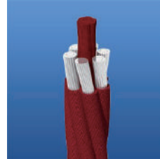
Climbing Net - 20mm