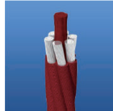
Climbing Net - 20mm