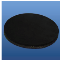
Jumping Surface Material