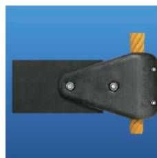
Jumping Surface Connector