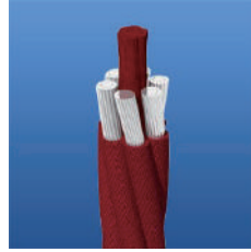
Climbing Net - 20mm