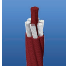
Climbing Net - 20mm