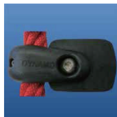
Seat & Shield Connector